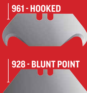
961 - HOOKED

The Sterling range includes a wide variety of premium quality blades to suit all safety knife and cutter applications.