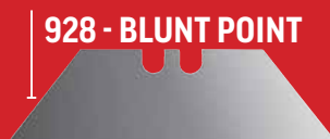
928 - BLUNT POINT