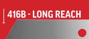
416B - LONG REACH