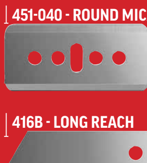
451-040 - ROUND MICA